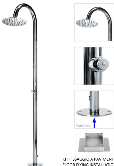
KIT FISSAGGIO A PAVIMENTO FLOOR FIXING INSTALLATION KIT